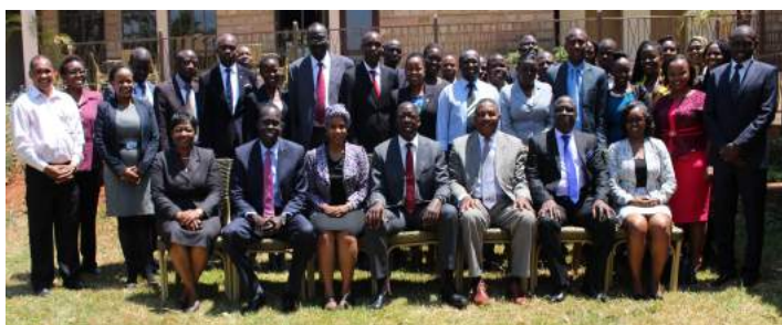
Photo: ICGLR-RMYF Capacity Building Workshop (21 st September 2015) Sagana, Kenya.

The main objective of the Capacity Building Workshop was to bring together members of the ICGLR-RMYF Executive Committee, the Interim Secretariat, the Conference Secretariat, the relevant National Coordination Mechanism (NCM) and the LMRC in a forum to develop the tools that would facilitate the effective operationalisation of the ICGLR-RMYF Secretariat and its supervisory organs.