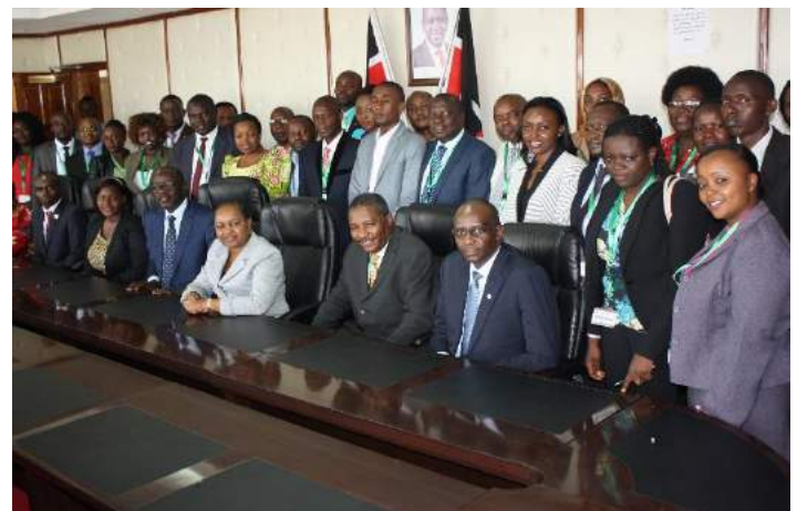
Cabinet Secretary Anne Waiguru with ICGLR-Youth Delegates (13 th April, 2015), Nairobi.

Following the Kenyan Government's offer to host the ICGLR-RMYF Secretariat, the ICGLR Youth Forum, in collaboration with the Government of Kenya, organised a Validation Workshop for the Establishment of the ICGLR-RMYF Secretariat from 24 th to 26 th March 2015 in Naivasha, Kenya. The aim of the workshop was to validate the Concept Note, the Budget, Structure of the Secretariat and Work Plan. Participants at this workshop included representatives from the ICGLR Secretariat; Levy Mwanawasa Regional Centre for Democracy and Good Governance (LMRC); ICGLR members of the Youth Forum from the Republic of Burundi, Republic of Kenya, the United Republic of Tanzania and the Republic of Uganda; the ICGLR Women Forum, Kenya; ICGLR Civil Society Forum, Tanzania; representatives from the Ministry of Devolution and Planning, Ministry of East Africa Affairs, Commerce and Tourism and Ministry of Foreign Affairs and International Trade. The outcomes of the workshop included a validated concept note on the establishment of the ICGLR-RMYF Secretariat, an approved budget, Staff Intent and Work Plan.