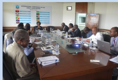
Participants at the Consultative Meeting of Experts working on Resilience in Zambia, Lusaka, 10 th November 2017.

The EARIH is a Consortium comprising the LMRC, The Consulting House (TCH) and the Intergovernmental Authority on Development Conflict Early Warning and Response Mechanism (IGAD-CEWARN).