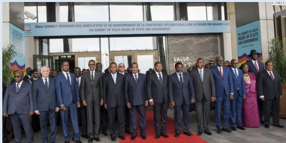
Group photo: ICGLR Heads of State and Government or their representatives, at the 7 th ICGLR Ordinary Summit on 19 th October 2017, Brazzaville, Republic of Congo.

The International Conference on the Great Lakes Region (ICGLR), organised a Summit of Heads of State and Government on the 19 th October 2017, in Brazzaville, Republic of Congo. The Summit, themed “ Fast-Tracking the Implementation of the Pact to ensure Stability and Development in the Great Lakes Region ”, was preceded by a series of meetings namely, the meeting of Financial Experts from Member States; the meeting of Chiefs of Intelligence and Chiefs of Defence Staff/Forces; the meeting of the Committee of Ministers of Defence; the meeting of the ICGLR National Coordinators and the Regional Inter-Ministerial Committee (RIMC).