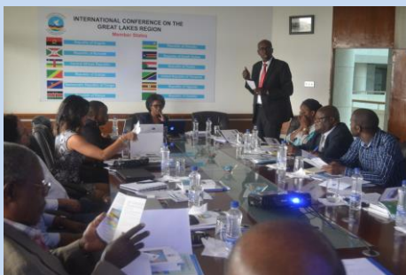
Participants at the Consultative Meeting of Experts working on Resilience in Zambia, Lusaka, 10 th November 2017.

LMRC hosted a Consultative Meeting of Experts working on Resilience in Zambia at its Headquarters in Lusaka, on 10 th November 2017. The objective of the meeting was to assess the implementation of the Eastern Africa Resilience Innovation Hub (EARIH) programme and to identify potential areas of partnership with other organisations working on resilience in Zambia.