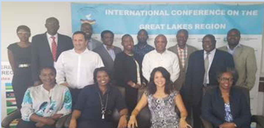
Group Photo: Participants at the Consultative Meeting of Experts working on Resilience in Zambia, Lusaka, 10 th November 2017.

LMRC hosted a Consultative Meeting of Experts working on Resilience in Zambia at its Headquarters in Lusaka, on 10 th November 2017. The objective of the meeting was to assess the implementation of the Eastern Africa Resilience Innovation Hub (EARIH) programme and to identify potential areas of partnership with other organisations working on resilience in Zambia.